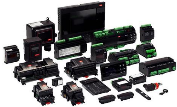
Electronic & Electrical Components