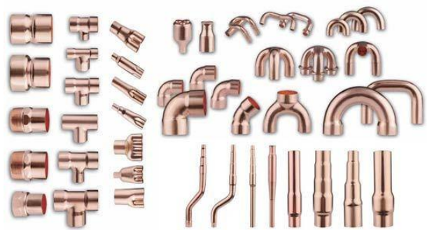
Pipes & Fittings