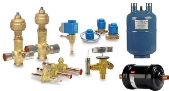
Valves and Parts