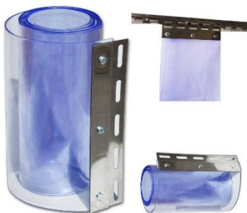
Cold Stores Spare Parts