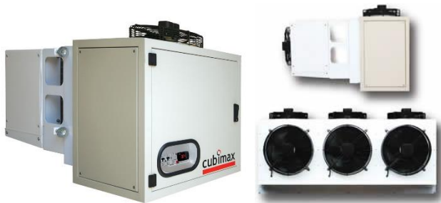
All-in-one Refrigeration System